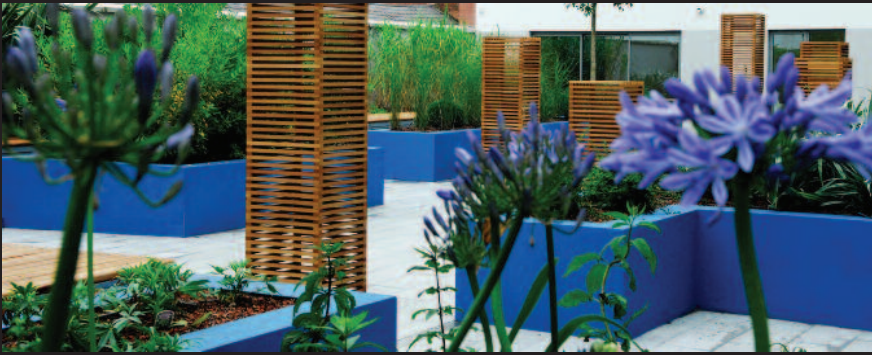
Image of the Courtyard Gardens at The Bakery

The evergreen trees and shrubs will form a robust structure all year round and act as a foil for a range of perennials. Grasses introduce sound and movement and contrast strongly with large leafed foliage while perennials of varying height bring colour, form and texture throughout. Specially designed lanterns provide atmospheric lumination while the dramatic three storey contemporary glazed link that crosses the courtyard reflects the scene and adds layer of visual interest. "The bold planting and inviting atmosphere creates a fusion between the indoor and outdoor spaces in a harmonising space that compliments the architecture beautifully".