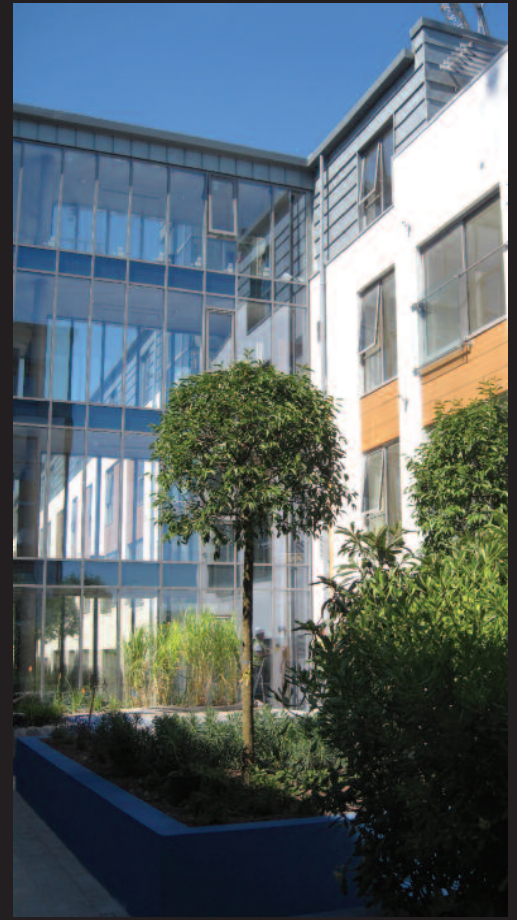
Image of the Courtyard Gardens and Glazed Link at The Bakery